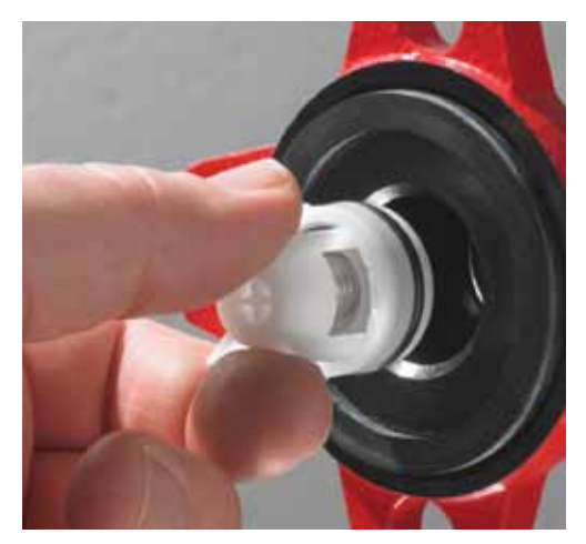
Separate Flow Check — The Honeywell flow check is sold as a standalone part so there is no need to stock a separate pump assembly.