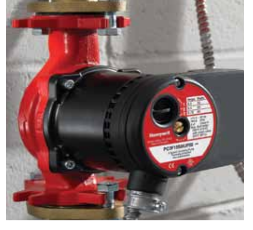
Quiet Operation — Reduced operational noise and vibrations help extend the life of the pump and eliminate callbacks.