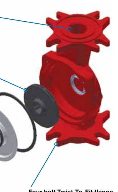
Four bolt Twist-To-Fit flange for installation versatility