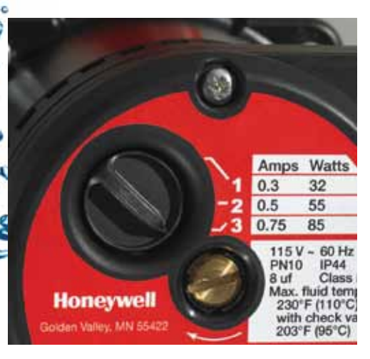
3-Speed Versatility — Maximize efficiency and provide sufficient flow rates with a single pump.

Whether you are installing a pump with zone valves or a complete circulating pump zoning solution, Honeywell now offers you one brand with endless application flexibility. With AquaPUMP you get: